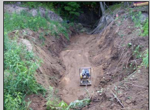
Erosion problem areas such as this one along the East Fork of the West Branch of the St. Joseph River in Hillsdale County, were repaired with funding help from the St. Joseph Watershed Erosion Reduction Project .

The project also produced a Geographic Information Systems (GIS) digitized layer of conservation practices in place in the watershed, which is expected to be very valuable to conservation agencies in the future as we work to place Best Management Practices (BMP) on the land. ■